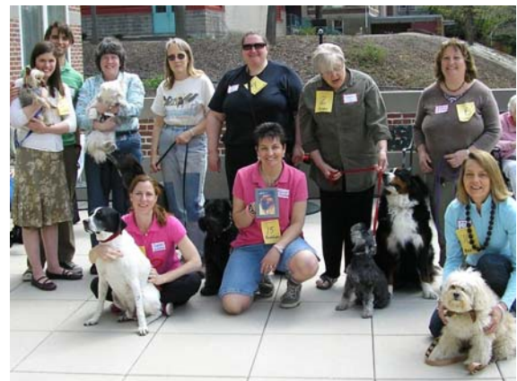
PetPals Dog and Cat Photo Show May 2007